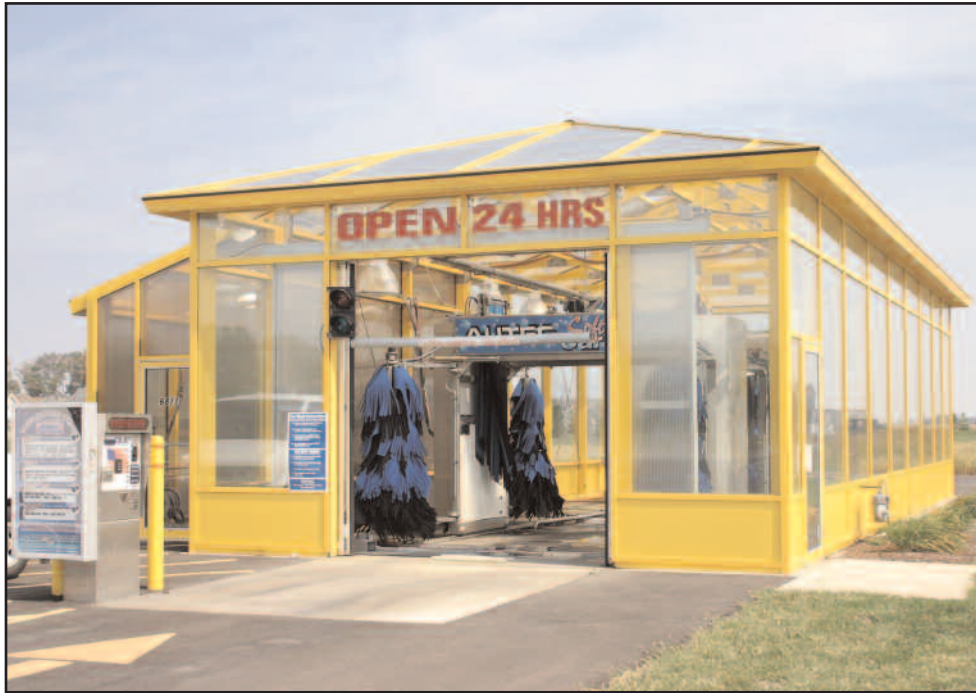
The CARess Car Wash on Finzel Road in Whitehouse is open 24 hours a day and services are available for purchase through the Sunoco station next door as well as at the car wash site.

Because some of the Blue Prairie homes back up to the car wash property, the resident asked if there was anything that could be done to lessen the brightness of the