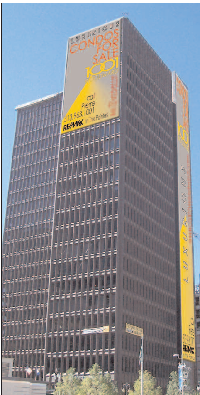
Large-scale banners advertise luxury apartments on the 1001 Woodward Building in Detroit. CGS Imaging of Maumee, which specializes in printing ultralarge graphics, produced the banners.

For more information, visit company's Web site at CGS-imaging.com