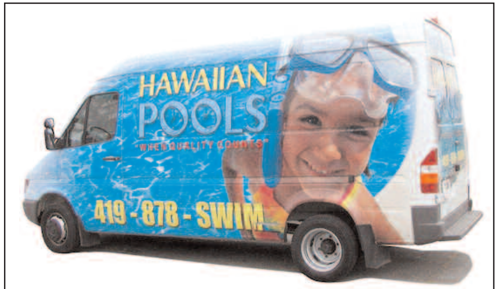
CGS Imaging creates eye-catching vehicle advertising for businesses such as Hawaiian Pools in Maumee. The company produces graphics and wraps for vehicles of all sizes, including cars, vans, buses and trucks.